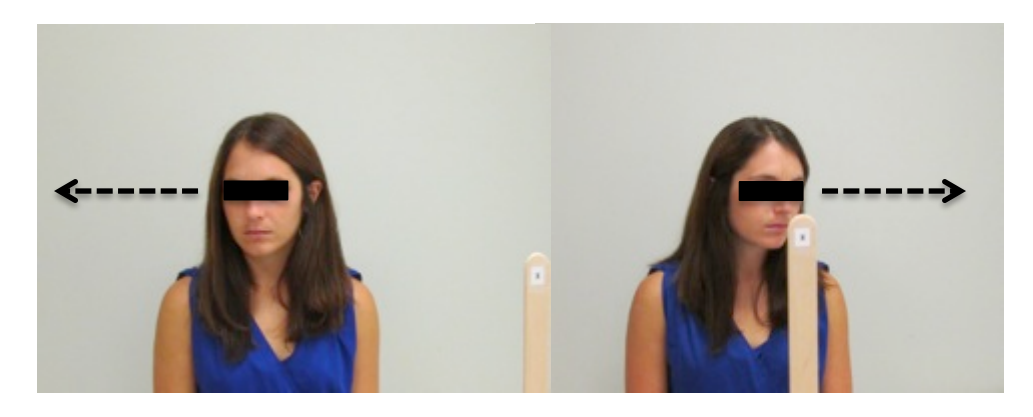
Figure 5. Horizontal VOR.