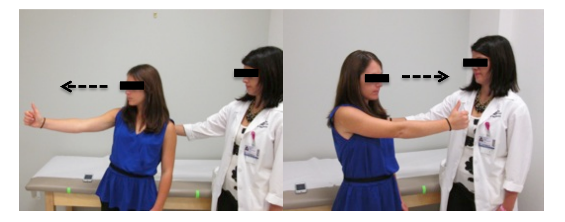
Figure 7. VMS.