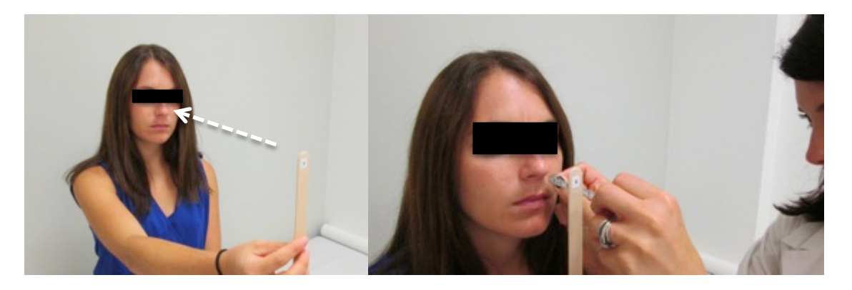
Figure 4. Convergence