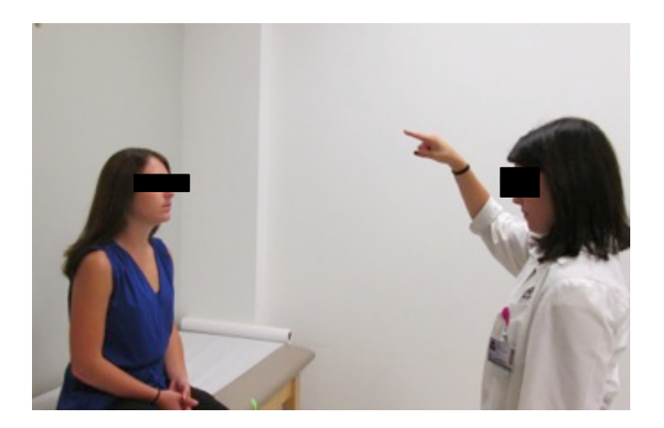
Figure 1. Smooth pursuits.